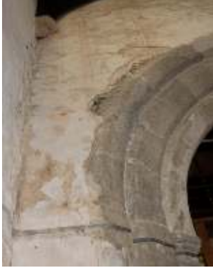
Water is damaging plaster and stone in the tower arch