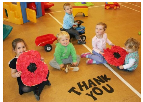
at Chishill Chimps

We raised the fantastic sum of £419.65, half of which will go to this year's Poppy Appeal.