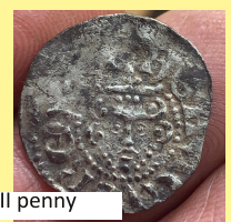
Henry III penny