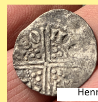
Henry III penny