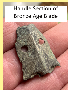
Handle Section of Bronze Age Blade