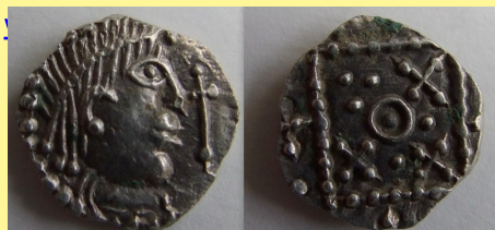
Saxon silver coin

For further information go to nhs.uk/thinkpharmacyfirst