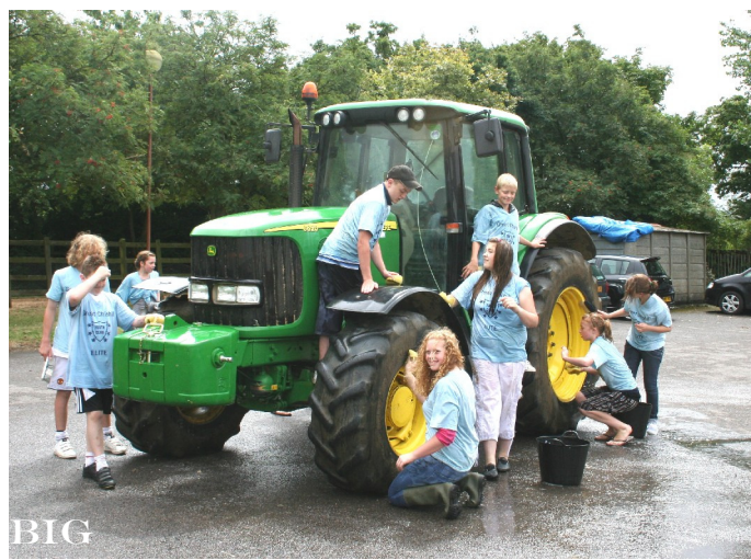
and smaller vehicles