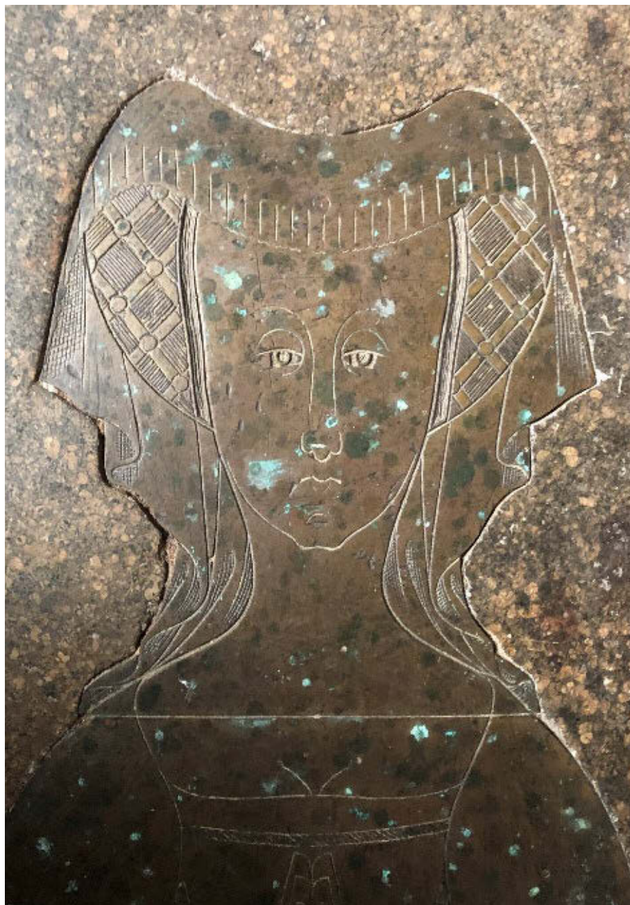
Bat droppings on brass