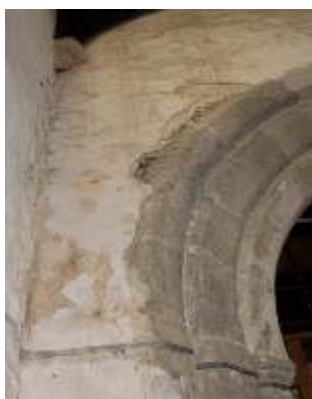
Water is damaging plaster and stone in the tower arch