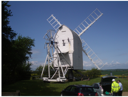
The Windmill being measured up for repair on 17 th May