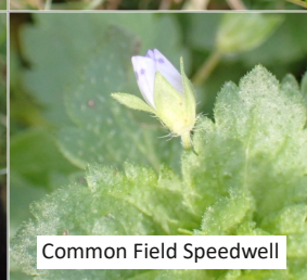
Common Field Speedwell